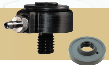
Aria ™ Hybrid Valve

For Use with the Vista Ankle or any Other Elevated Vacuum System