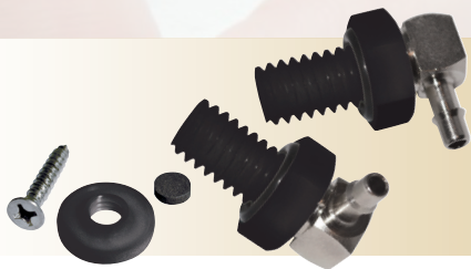
Aria ™ Safety Barb